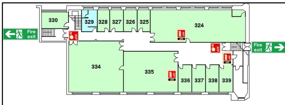
James Watt building North Level 3: Floorplan