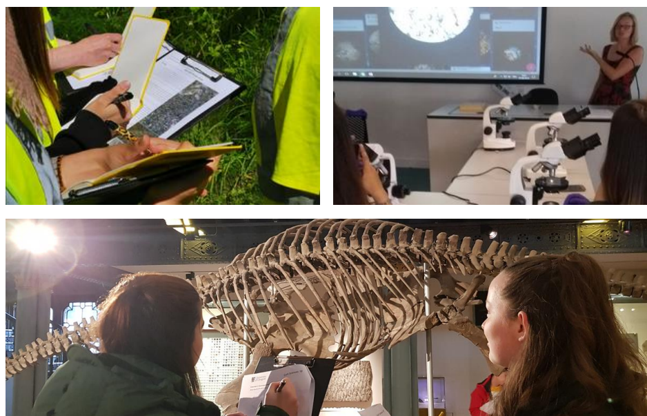
Figure 1. On Campus GIG Scotland activities

The first GIG Scotland event took place in 2019, consisting of interactive talks, hands-on workshops, and a visit to the Hunterian Museum. As a response to the pandemic, online UK-wide events took place in 2020-21 with GIG branches from Scotland, Plymouth, Wales, and Ireland collaborating to deliver inspiring speakers, workshops, and virtual fieldtrips, providing an insight into the wide variety of exciting careers and opportunities available in the field.