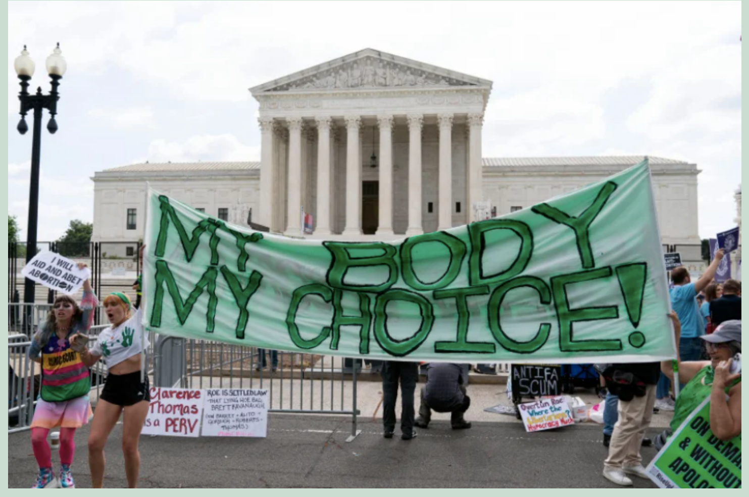
Abortion rights activists gather outside the Supreme Court in Washington, Friday, June 24, 2022.

University of Glasgow's Centre for Gender History brings together one of the largest concentrations of gender historians in the UK.