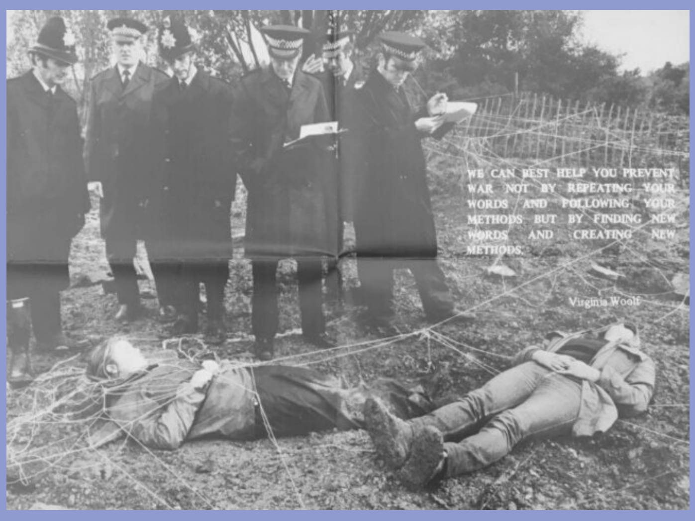
Greenham Women's Peace Camp from Glasgow Women's Library Collections

University of Glasgow's Centre for Gender History brings together one of the largest concentrations of gender historians in the UK.