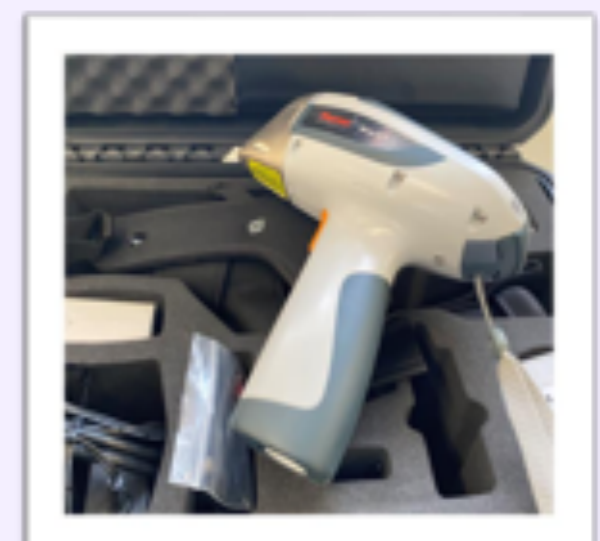
Figure 5, photograph of the portable XRF instrument used in the study

Performing this case study and using the XRF instrument in a lab setting allowed those involved to not only get practical experience with this technical process, but also enrich the user manual and hopefully set up future readers in using and interpreting XRF analyses. Beyond the Reni able to be studied, the user manual now exists as a reference, and is accessible to perform more interpretations in settings in the future.