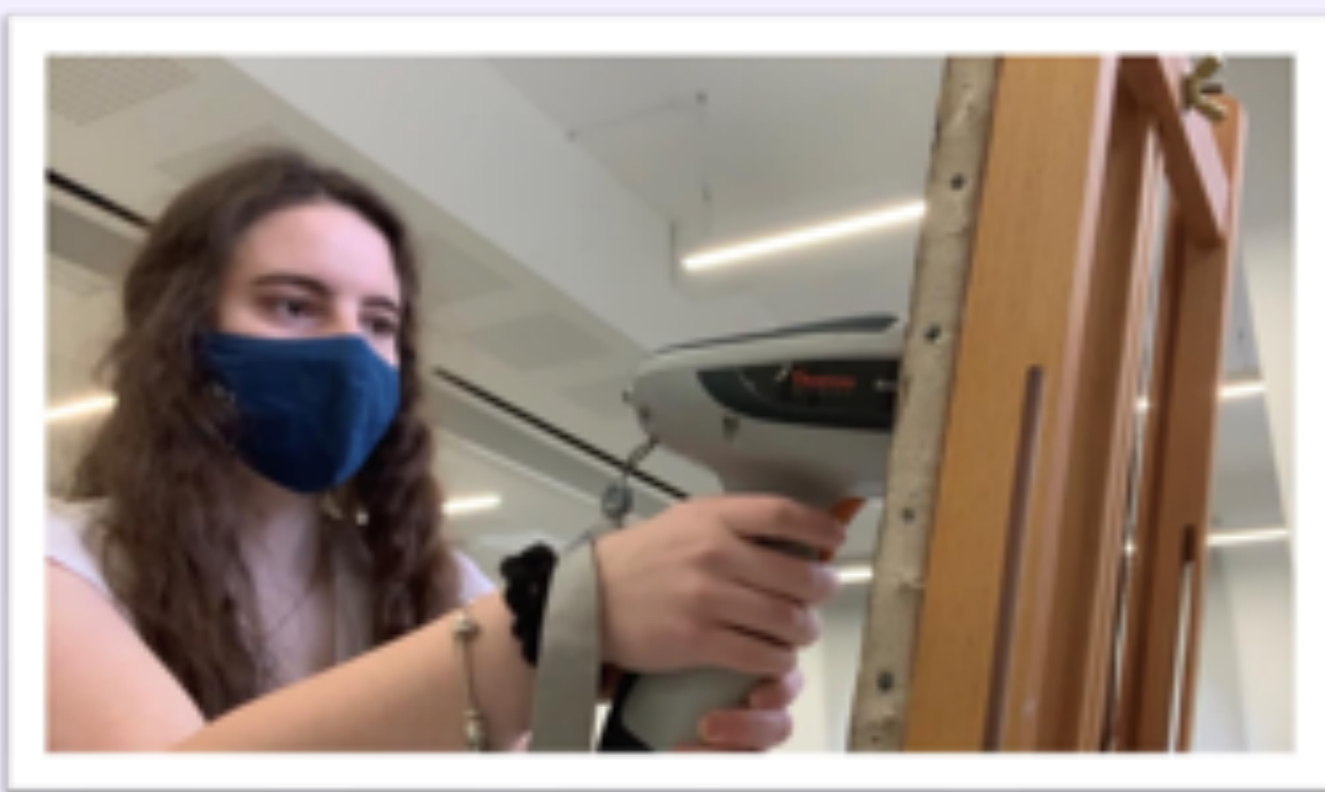
Figure 6, photo of the handling of the XRF on the painting, photo by Noa Leibson

This work placement was primarily focused around The TAHG Lab's portable XRF instrument, used to analyze the materials of artworks. My mission was to write a user manual for new users and non-scientists without a background in XRF so that they may easily pick it up and utilize the scanner in art studies. The original intent was to use this equipment on the Antonine Wall, but with COVID restrictions, this was instead carried out on art replicas in the lab.