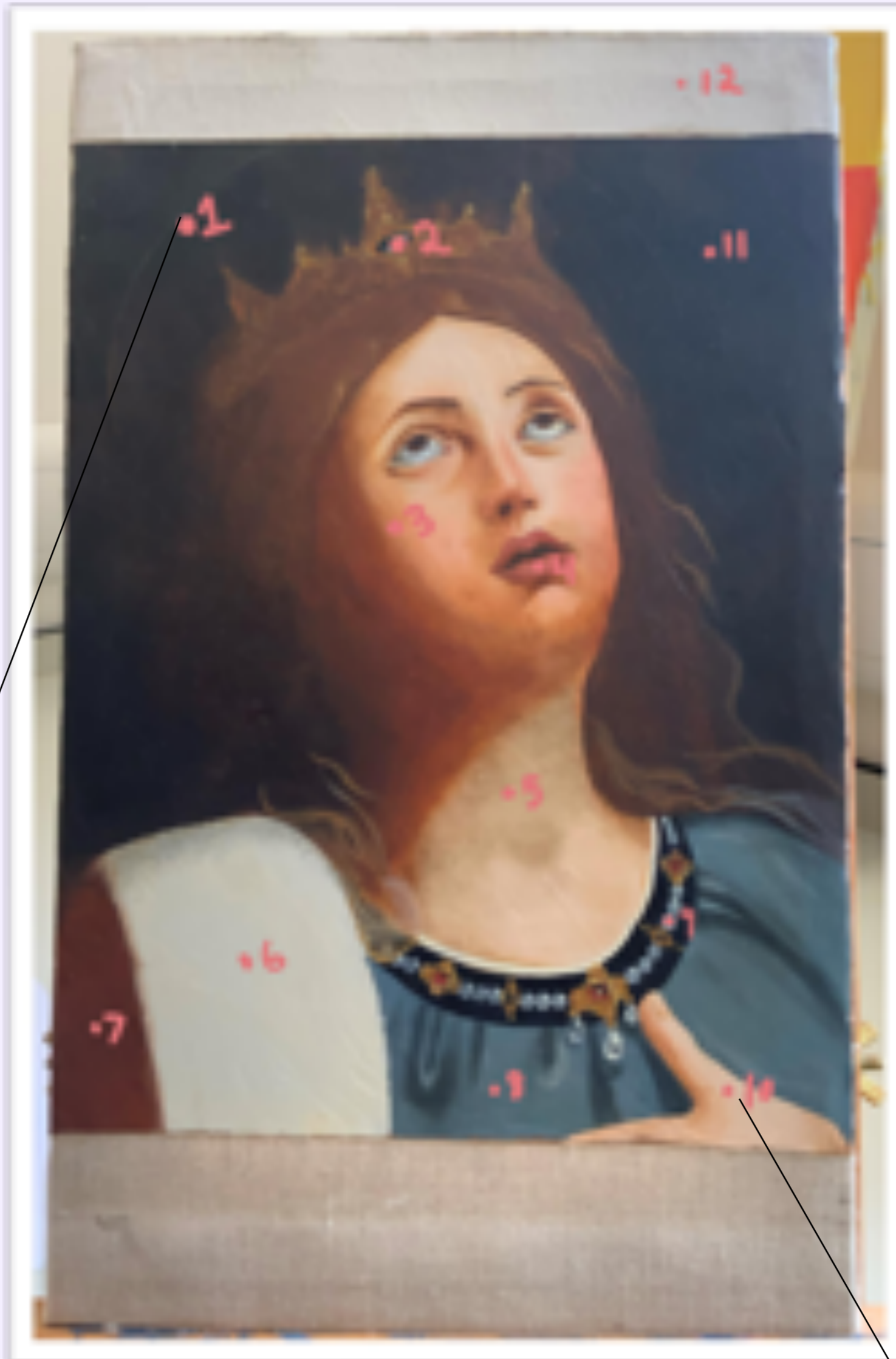
Figure 4, replica of portrait from Guido Reni's workshop, oil on canvas. Numbered points represent the sample sites and were added by Noa Leibson

As such, over the course of the project the XRF scans were carried out the XRF on a replica of a painting by Guido Reni's workshop. A replica is a great way to learn XRF, since we likely know the materials used and can complete a cross-comparison with the findings.