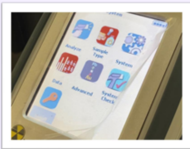
Figure 3, photograph of XRF user interface, photo taken by Noa Leibson

The device is a non-destructive analyzer that uses X-ray technology to identify the elemental makeup of the samples it is analyzing. While not without its drawbacks, a scan can offer a basic outline for the composition of things such as pigments and minerals. The scanner fires an X-ray beam at the artwork being analyzed. The area being fired at then becomes 'activated,' and the excited and unstable electrons in the artwork's materials dislodges its orbital shells. An electron from a different orbital shell takes up the vacancy, and this movement is captured by the XRF. The instrument can measure this and discern which elements are present in the sample, based off their movement and how they react. And once we know the elemental make-up of an artwork, one can discern which pigments were used in its creation.