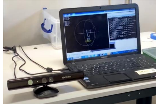
Motion capture sensor

The University of Glasgow are international leaders in research and development on wireless communications systems and their applications. AWTG Ltd. are pioneers in the design, development and deployment of mobile networks and their applications. AWTG have created a large number of 5G applications in the recent past.