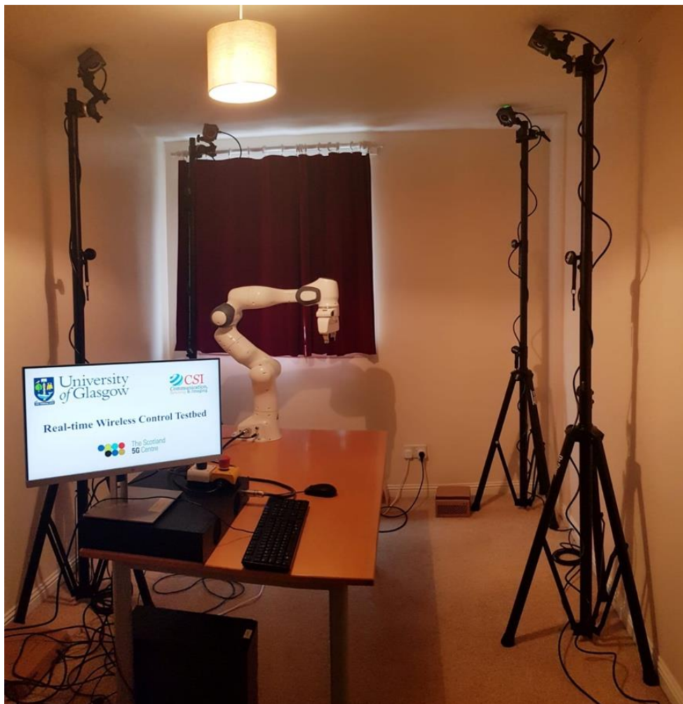
Real-time wireless control testbed with motion capture and robotic arm