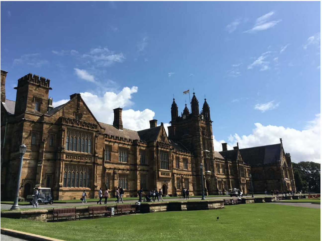
Main campus of the University of Sydney