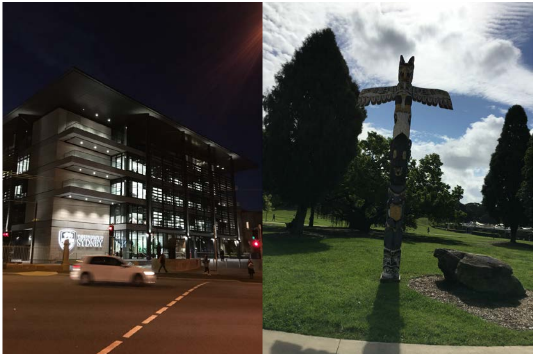
Night view of the University of Sydney and the Victoria Park