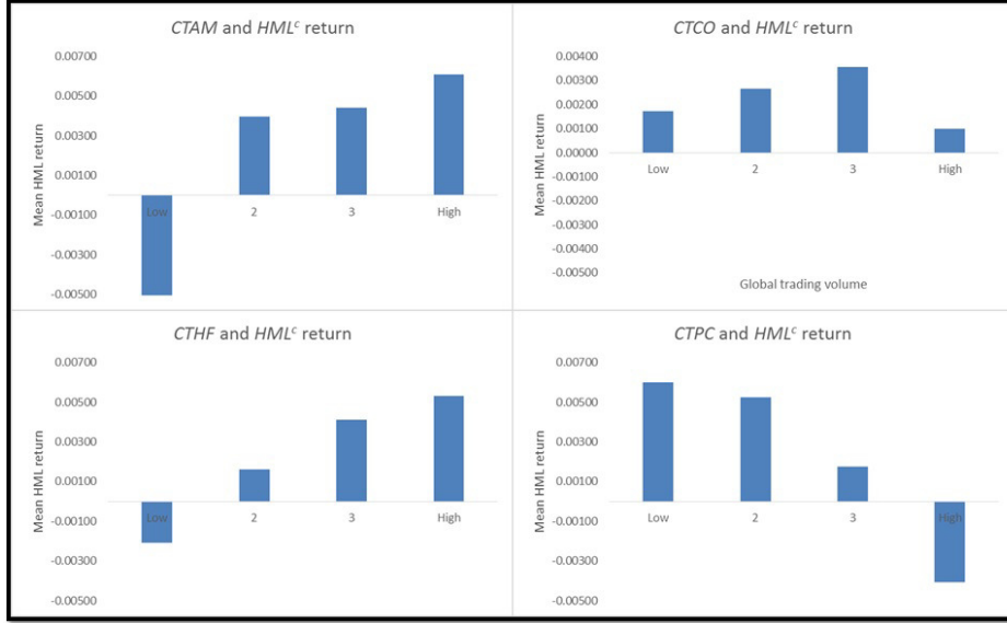
Figure 2: Disaggregated Carry-Trade Order-Flow and HML Returns

Note: This figure shows mean excess returns for the HML portfolio depending on the quartile of the distribution of the disaggregated carry-trade order-flow factors CTAM, CTHF, CTCO and CTPC.