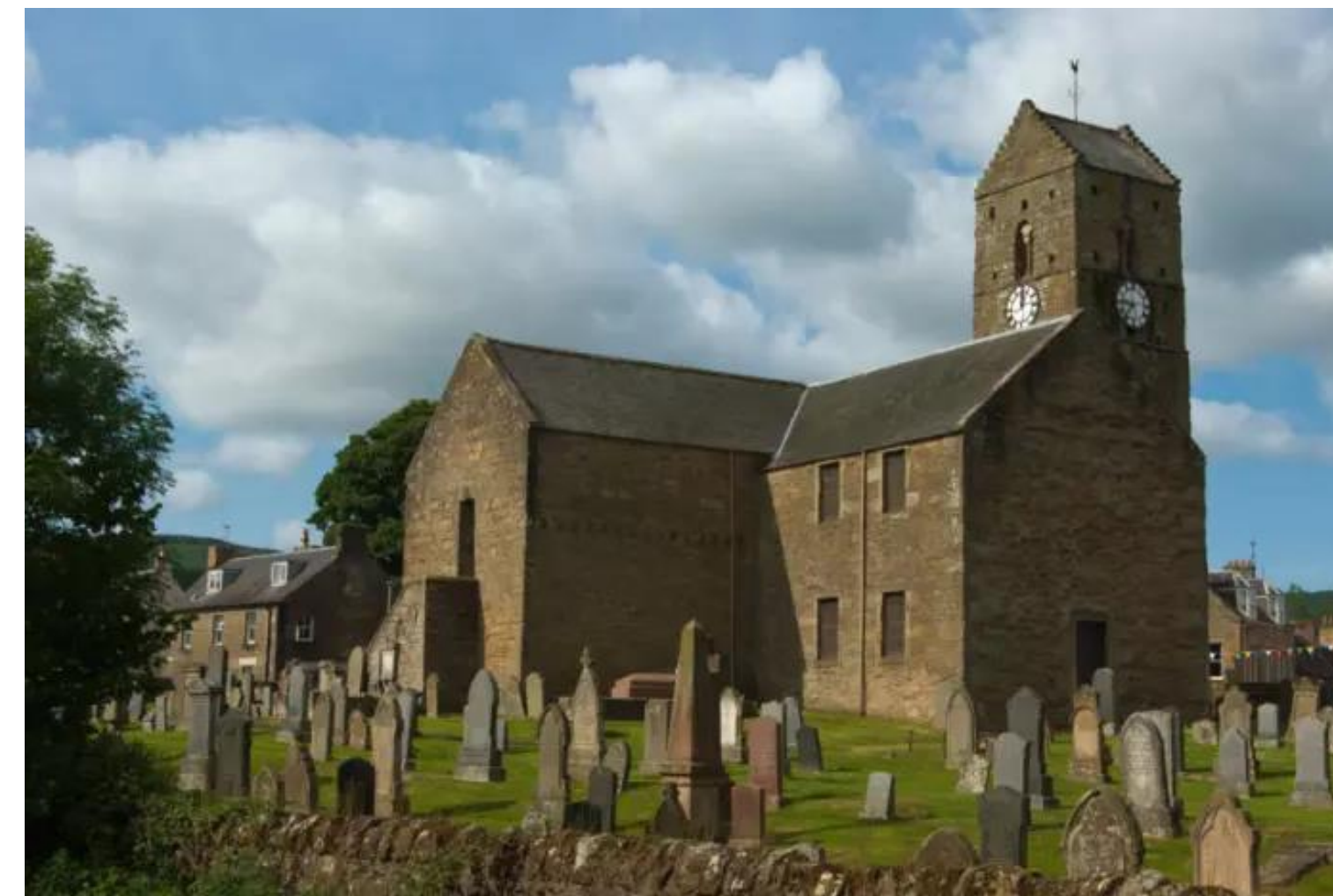
Kirk of Dunning, Perthshire

The riot at the kirk of Dunning in 1652 is evidence of increasing female activism in the ecclesiastical realm and of gender expectations. Around 120 armed women chased synod elders out of the town to protect the ministers of Dunning and Auchterarder from deposition for 'malignancy'. The leaders were the wives of the deposed ministers, but there is little other evidence of male involvement. Mercurius Politicus recorded that this was an 'ominous disaster' for the hardline regime whereas the Kirk downplayed the female aspect of the riot, stating that this was supported by 'men... cled w[i]t[h] womens cloaths'.