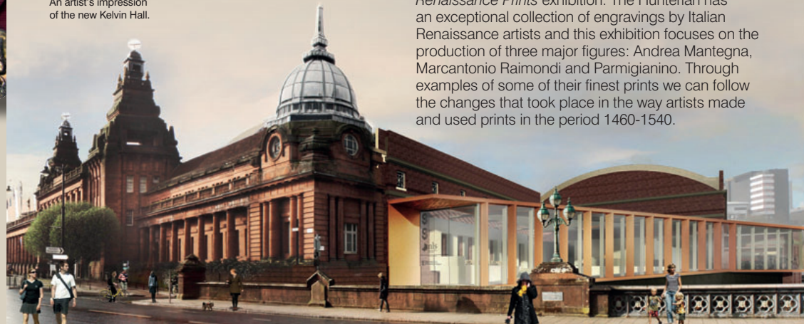
An artist's impression of the new Kelvin Hall.