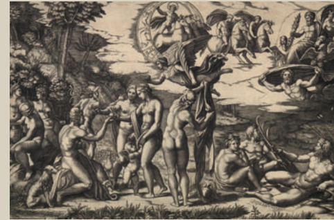
Marcantonio Raimondi, The Judgement of Paris , c. 1510 - 1520.