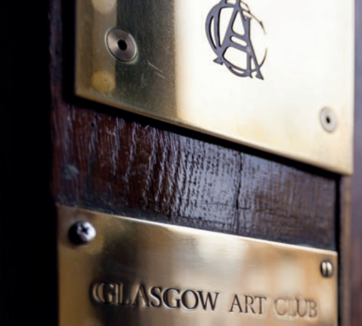
Photographer Mark Osborne. Courtesy of The Glasgow Art Club.