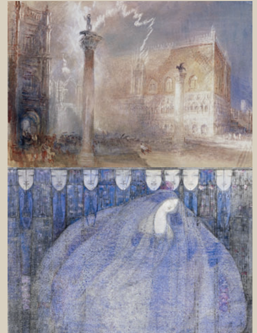
Joseph Mallord William Turner, The Piazzetta, Venice , National Galleries of Scotland, Photography by AIC Photography Services.