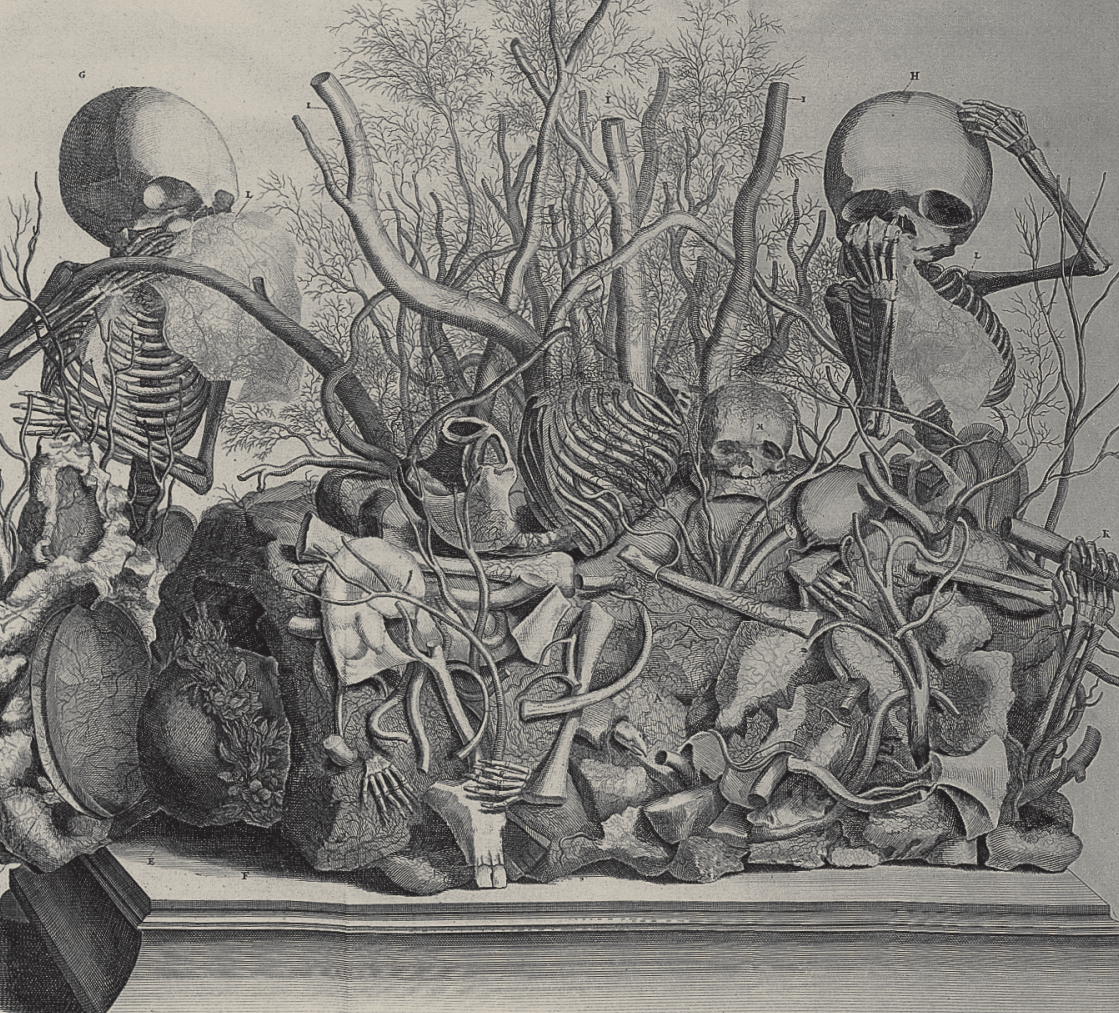
Frederik Ruysch, Opera omnia , 1727.