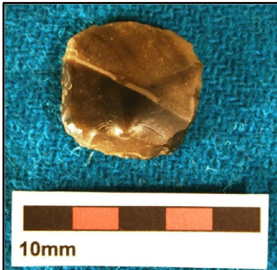
Figure 1: Post-Medieval gunflint recovered from Dunknock.

The artefact does not fit within the principal typologies for manufactured gunflints (Skertchly 1879), although the wedge form morphology is broadly similar to an illustration of a German gunflint ( ibid. Figure 61). The gunflint (L 28mm; W 30mm; Th 8mm) has retouch to all four edges. There are common differences to an artefact found in Suffolk and reported by the Portable Antiquities Scheme in England (Reference SF-BE0AE8). The finds location may suggest that it was manufactured at the Brandon flint works. The Suffolk gunflint is also a wedge form with continuous retouch (L 30mm; W 30mm; Th 9mm), and has been interpreted as Post-Medieval dating to 1550-1800CE (Pendleton 2011).