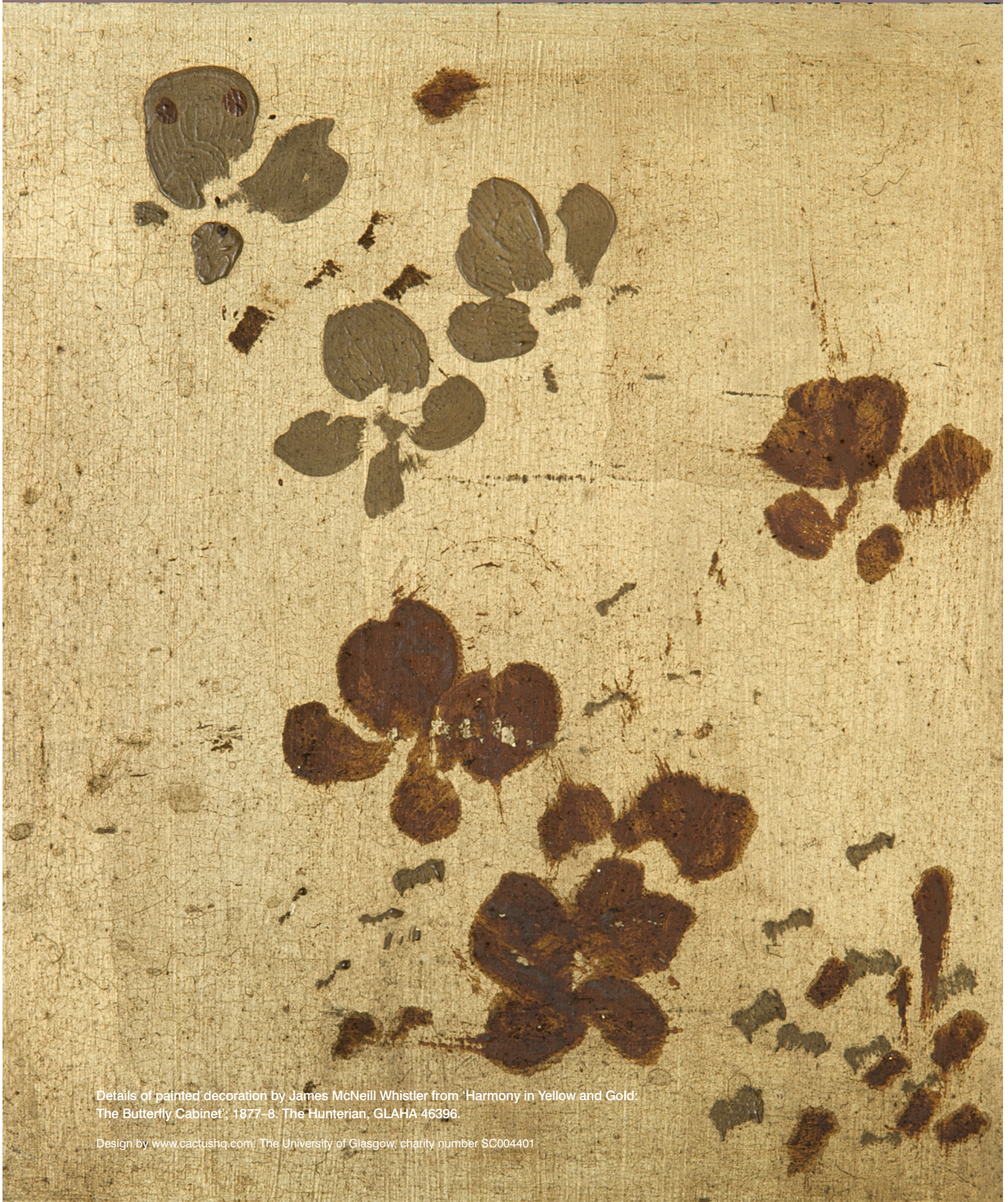
Details of painted decoration by James McNeill Whistler from 'Harmony in Yellow and Gold: The Butterfly Cabinet', 1877-8. The Hunterian, GLAHA 46396.

Further information can be found at: www.glasgow.ac.uk www.glasgow.ac.uk/hunterian www.special.lib.gla.c.uk www.artist.arts.gla.ac.uk