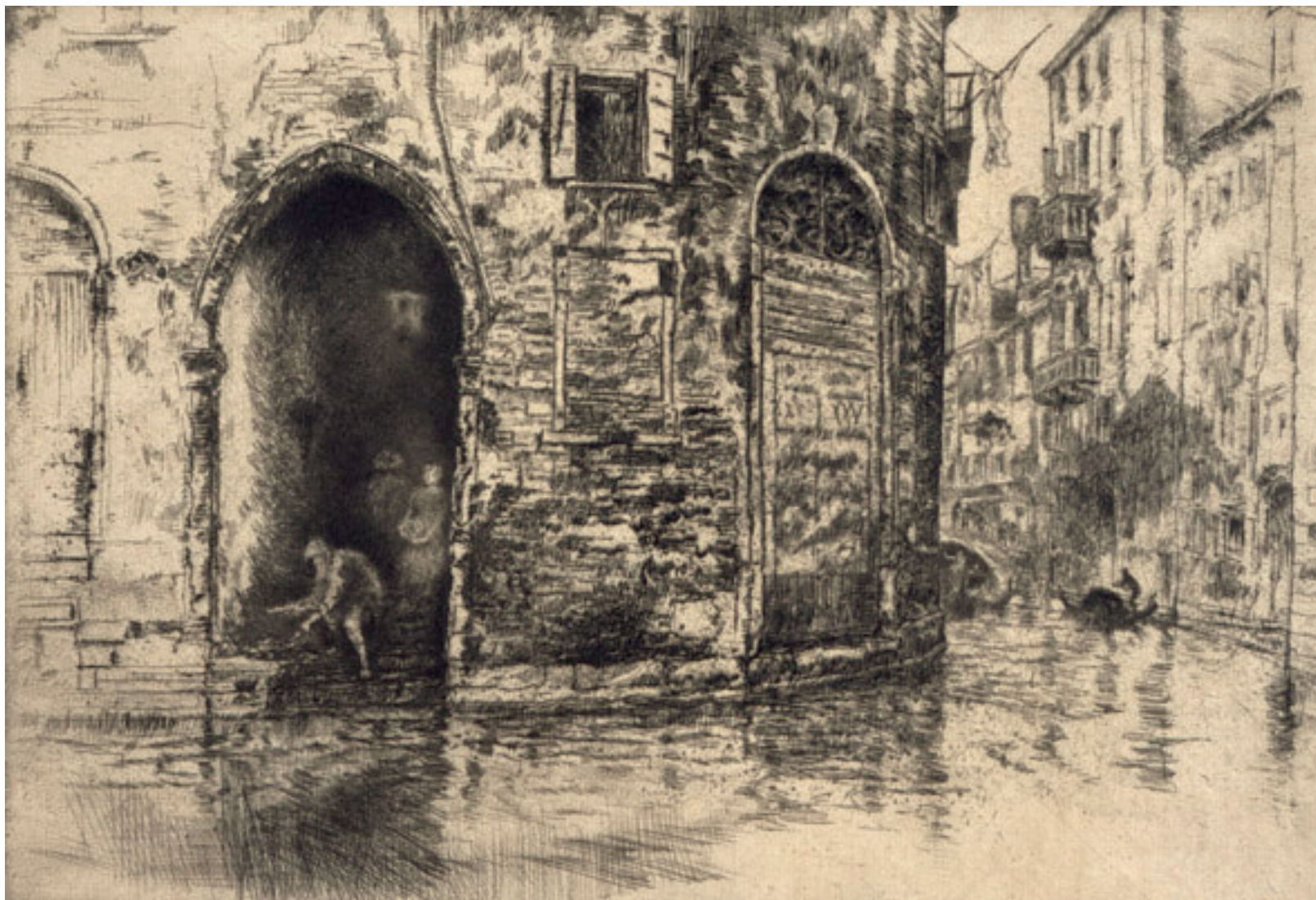
James McNeill Whistler, 'The Two Doorways'; 1880, etching and drypoint. The Hunterian, GLAHA 46611