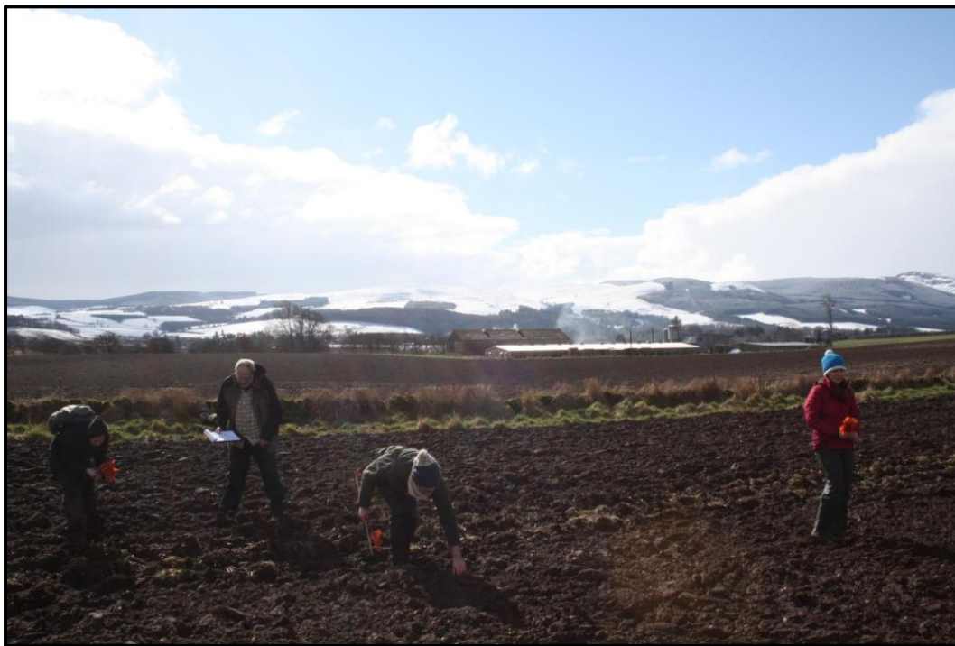
Figure 2: Fieldwalking on a bitterly cold day in Spring 2013 at Leadketty. In the middle ground is the field where the 2012 SERF excavations were undertaken. The background shows the Ochils covered in snow.

A fragment of the bowl of a clay pipe was also collected. The letters 'G L' are inscribed on the bowl.