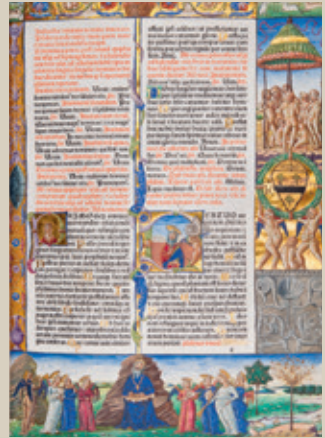
Breviarium Romanum, Venice: Nicolaus Jenson, 1478. Sp Coll Hunterian Bf.1.18.