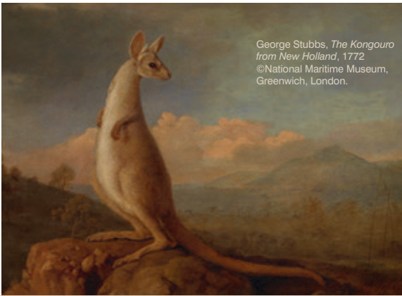
George Stubbs, The Kongouro from New Holland , 1772 ©National Maritime Museum, Greenwich, London.