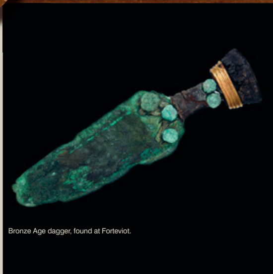
Bronze Age dagger, found at Forteviot.