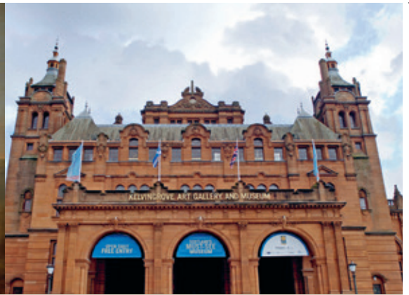
Kelvingrove Art Gallery and Museum