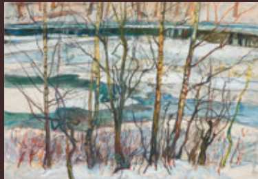
Duncan Shanks, Ice on the river from the kitchen window, Christmas 2009.