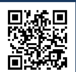
Image tecca.com | Scan the QR code with your device if you'd like to find out more about this study.

Zepke, N and Leach, L (2005). Integration and adaptation: approaches to the student retention and achievement puzzle in Active Learning in Higher Education 6(1): pp. 46-59.