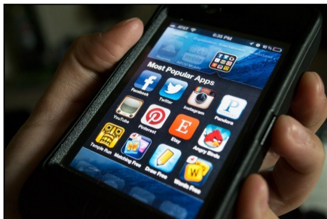
Fig.1 Social media can be accessed via smartphones and other portable devices within lectures, seminars and tutorials.

How the technology is used and how it is integrated into the learning process is important. Zepke and Leach (2010) suggest that motivation and student dispositions will influence their ability to engage in interactive learning, where the line between online learning and socialisation is becoming blurred.