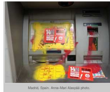
Madrid, Spain.