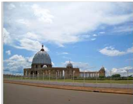
Yamoussoukro, Cote D'Ivoire.

Posted on November 3rd, by Kaisa Hartikainen in Featured , Spotlight . 0 Comments