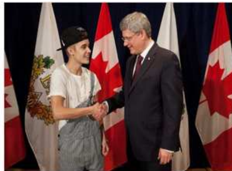
The National Post , Stephen Harper awards Justin Bieber a Diamond Jubilee Medal