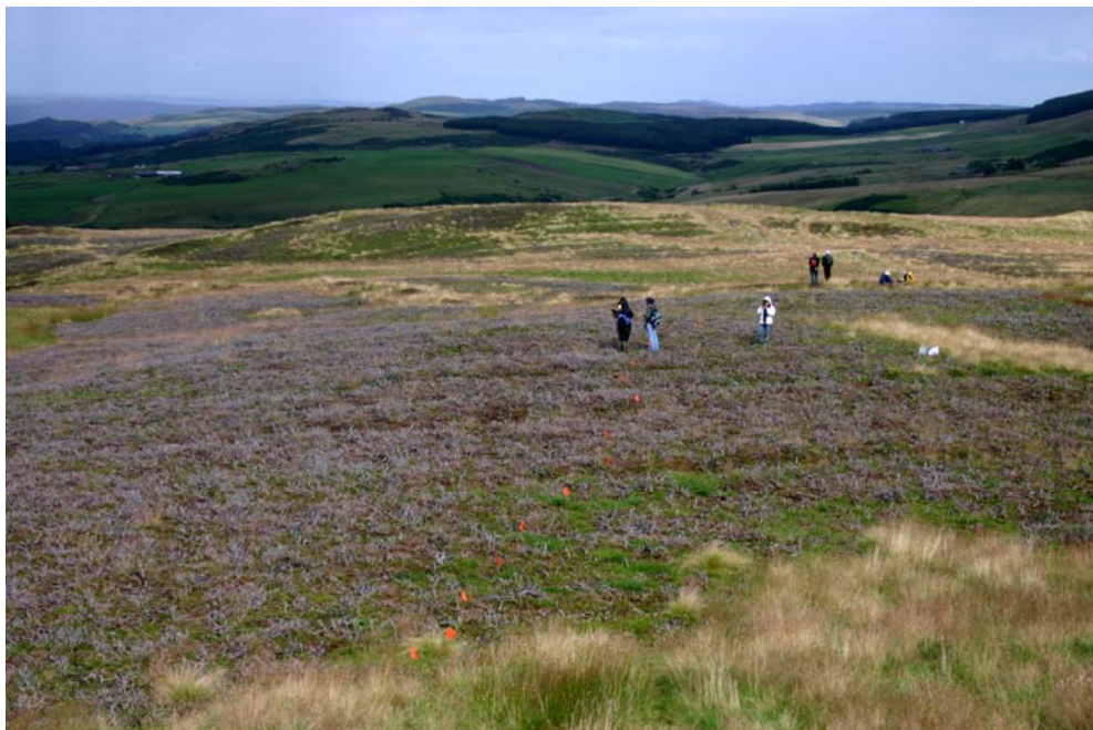
Figure 7. Rig and furrow cultivation on Casken Hill, looking north-east. The strips run from right to left, each one marked with a flag (SF020)

Both these areas of cultivation were presumably used mainly for oats, with some bere barley and legumes (Cowley et al. 2001: 21).