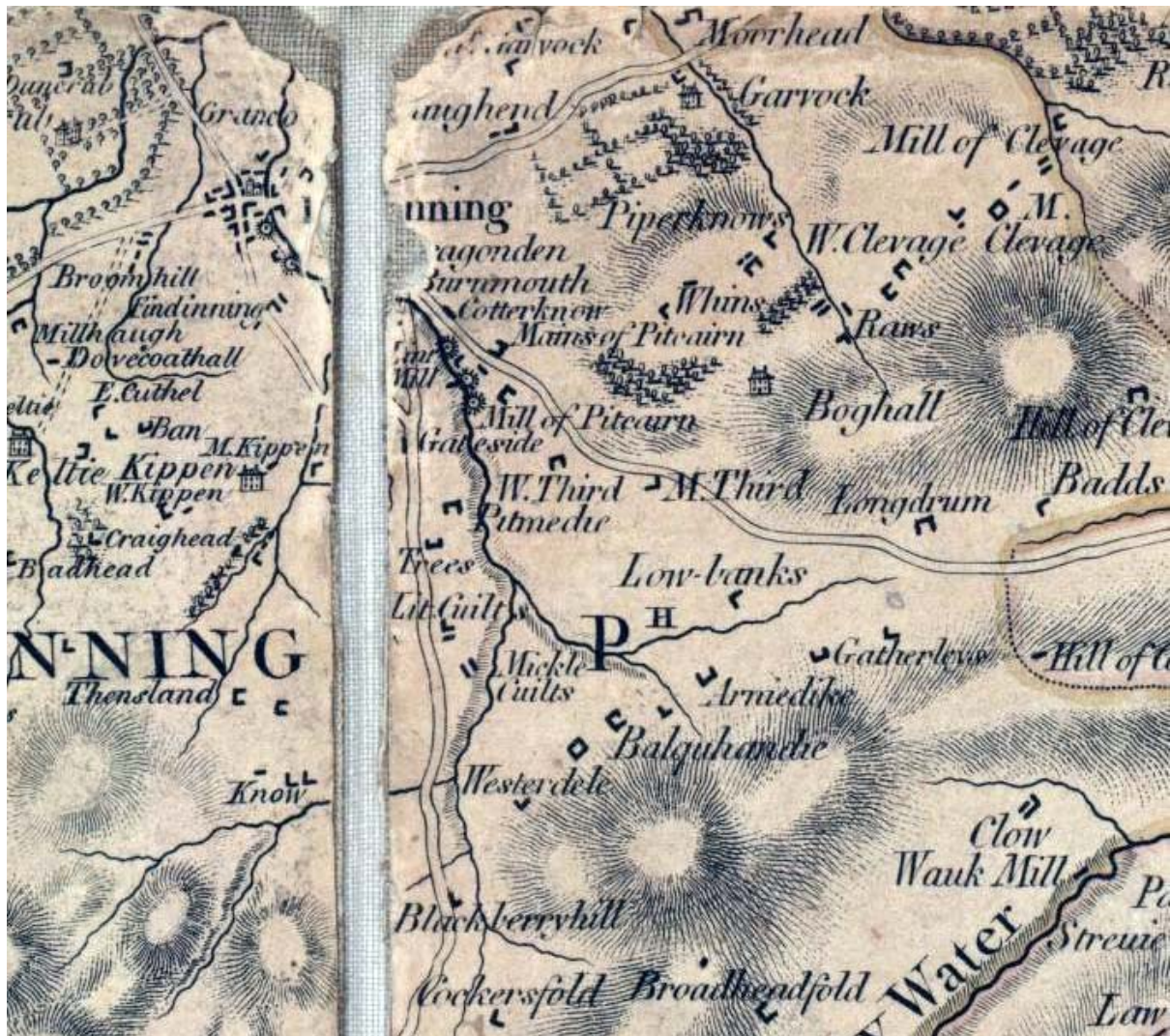
Figure 5. James Stobie, The counties of Perth and Clackmannan , 1783. Note Know (Knowes Farm) and Blackberryhill (presumably the abandoned settlement now called 'Blaeberry Hill'). http://www.nls.uk/maps/early/664.html

also mentions 'the meall that had been exacted from the country about by way of tax, and had been laid up in my Lord Roll's house of Duncrub' (Reid 1989: 136).