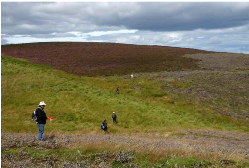
Figure 1. Walkover survey on the Black Hill of Kippen

This reports first summarises the aims of the SERF Landscape project as a whole, and then discusses the results of the brief walkover season in August 2007.