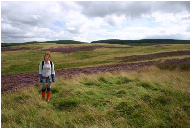
Figure 6. Hut platform on Eldritch Hill (SF025)

A clear hut platform on the slopes of Mount Eldritch, previously unrecorded, is likely to be Iron Age (SF025; Figure 6; near SW corner on map in Figure 8). The platform is flat and circular, 4.3 m in diameter, and has a distinct though shallow ditch surrounding it, especially on the NE (downslope) side.