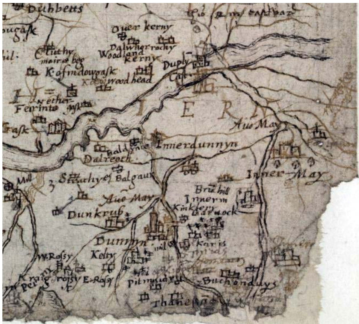
Figure 2. Pont's map, late 16th century (Map 21). To the south of Dunning can be seen Kelty, East Rossy, Pitmuidry (Pitmeadow), Buchanduy's (Balquhandy?), Thanesland. http://www.nls.uk/pont/

Each day a team of between 4 and 6 students walked systematically across the southern part of the farm c. 20 m apart, flagging any features of interest, and returning to record them on a form and discuss their interpretation. In this way we sampled an area c. 800 x 1800 m, and recorded 35 sites. The data on the forms was entered into the project database, and the location of the features was digitised on the GIS.