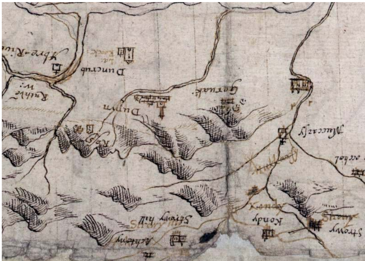
Figure 3. Pont's map, late 16th century (Map 22). North at top, with the River Earn. It shows Duncrub, Dunvn (Dunning), Garuak (Garvock), Strowie Hill (Struie), and Muccassy (Muckersie). http://www.nls.uk/pont/

Historical maps consulted so far include maps by Timothy Pont in the late 16th century (Figure 2, Figure 3), General Roy's military map of 1747-54 (Figure 4), James Stobie's map of 1783 (Figure 5), and the first (1862/1866) and second (1901) edition Ordnance Survey maps. In general, there is good continuity of place names. Knowes Farm first appears in 1783. Thanesland disappears between 1783 and the 1860s. Settlement on Pont, Roy and Stobie's maps seems mostly concentrated in the valley bottom and on the lower slopes up to about 200 m asl. Moving southwards over the Ochils, there is nothing marked until the valley of the Water of May.