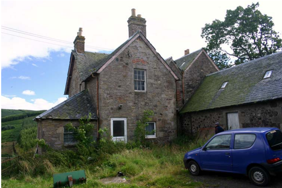
Figure 9. Knowes Farm: the farmhouse from within the yard, looking south.

Knowes Farm itself is a two-storey symmetrical gabled stone farmhouse, very much in keeping with improvement ideology, and sits in the south-west corner of a yard surrounding by stone stables and byres (Figure 9). These show various building phases, but apart from three obviously recent structures, the complex clearly dates from the second half of the 18th and 19th centuries.