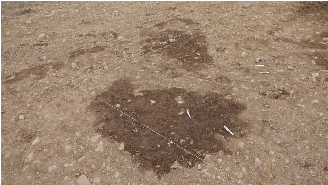
Figure 15 Typical features in the avenue junction area pre-excavation

Feature [5654] was oval in plan and flat-bottomed with sloping sides. This feature was 1m by 0.8m in plan, but was only 0.21m deep. The single fill (5655) was a dark brown silt with c.20% stone inclusions.