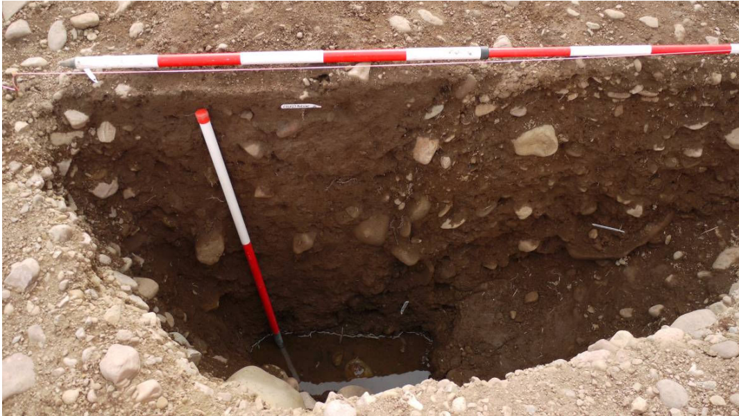
Figure 7: Northeast facing section of [5518]

Posthole [5518] was bisected by fairly shallow modern drainage feature [5520] (see below). This ramped posthole measured some 1.6m by 1.05m, with maximum depth of 1.2m. The upper fill of the ramp on the NW side of the feature (5662) was medium orange-brown sandy silt, with gravel and infrequent stone inclusions, as well as several pink clay lenses, as in the ramp fill of [5538]. The lower ramp fill (5672) was darker orange-brown sandy silt, also with gravel and infrequent stone inclusions, though also had charcoal inclusions towards the bottom of the context. Within this charcoal was a single example of a charred nutshell. The postpipe (5572) was a very homogenous dark brown silt fill, with charcoal inclusions towards the bottom of the context.