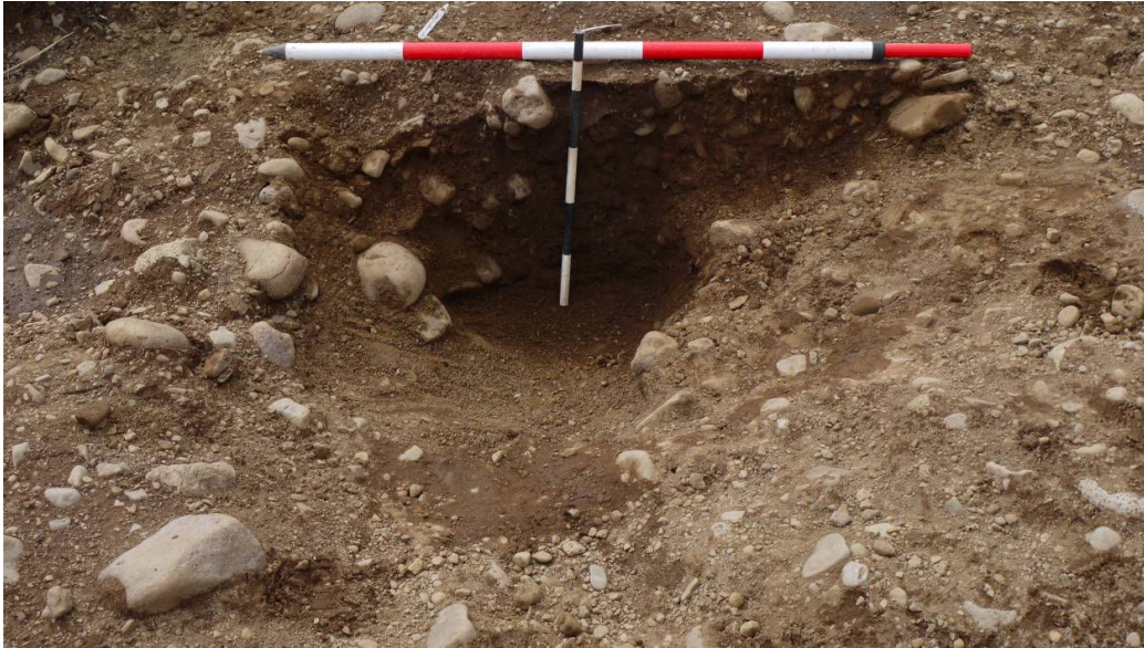
Figure 14 Section through possible posthole [5646]