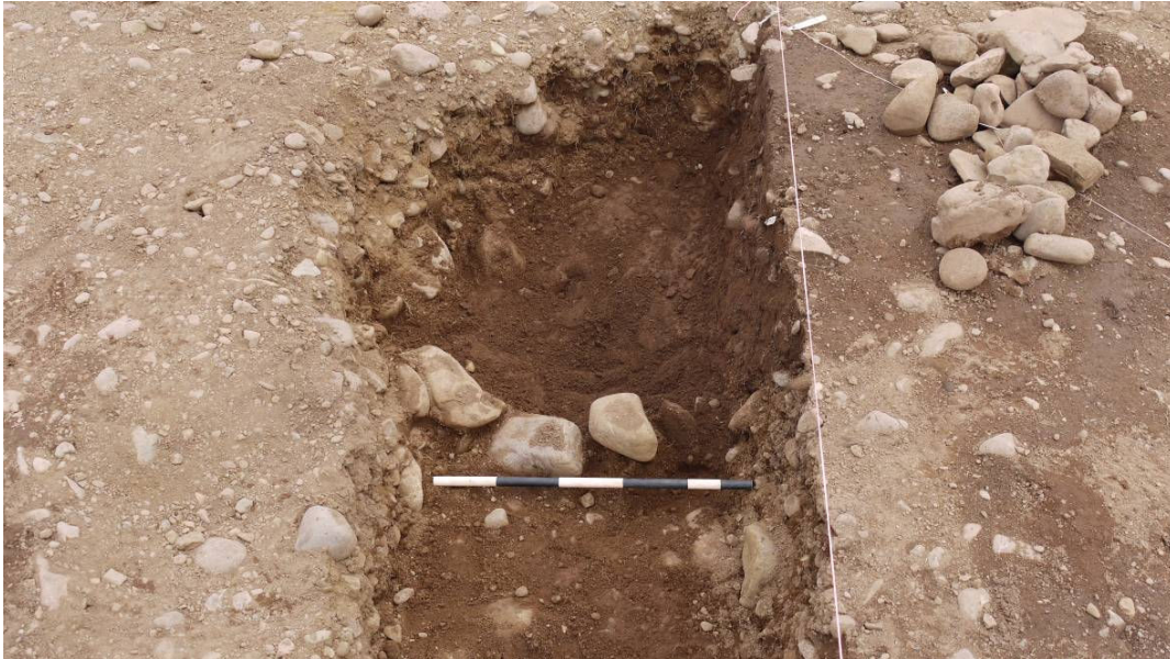
Figure 8: (5519) packing stones

Posthole [5592] was a very difficult feature to define and excavate, in part due to the posthole apparently cutting an earlier feature that had not been identified in plan. Posthole [5592] measured 1.2m across in plan, with a maximum depth of 1.12m. There was no evidence for a ramp in [5592]. The possible postpipe of [5592] was (5593), dark orange-brown sandy silt with flecks of charcoal. This was distinct from the upper packing fill (5683), which was a medium yellow-brown sandy silt containing frequent rounded pebbles. This fill may have been the natural used as packing. Below (5593), were packing stones (5604). The packing appeared to have tumbled down the sides and towards the bottom, possibly after the post was removed, or as it rotted. Below this stone fill was (5684), medium yellow-brown silt containing charcoal and very infrequent stones. The lowest fill (5685) contained notable amounts of charcoal, as with the other postholes. Little can be said about the feature which [5592] cut due to the difficulty we had in identifying the complex nature of this feature in plan. However, it is possible that [5562] represents an earlier post replaced more or less in the same location.