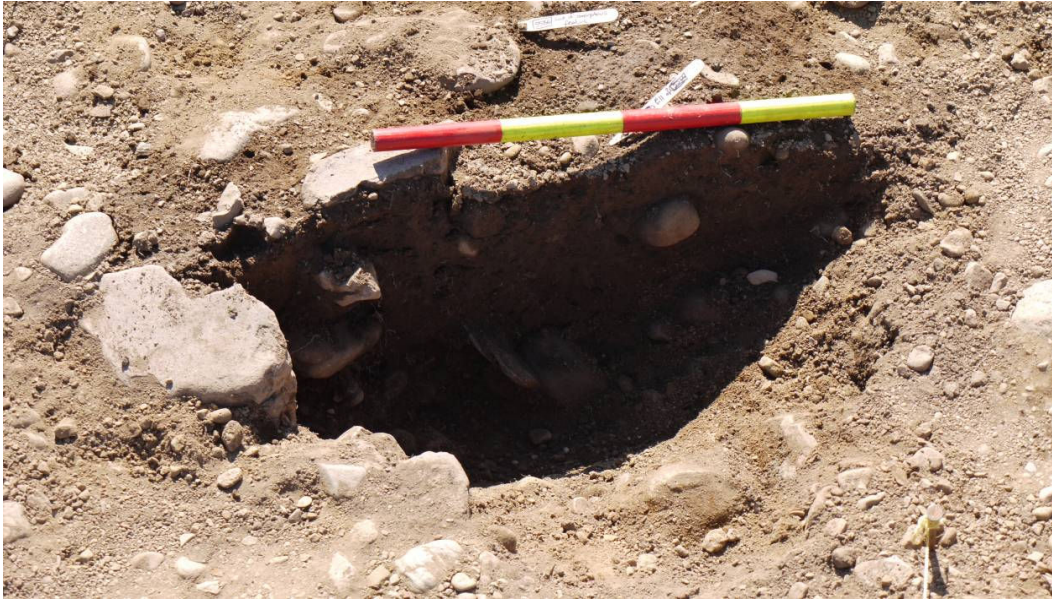
Figure 13: Small post or pit [5566] on semi-circular setting

presence of the stones could indicate they were remnants of packing for a post (see Figure 13). The third feature [5568] was quite difficult to differentiate from the natural, and was similar in nature to [5566]. The fourth feature of the setting was palisaded enclosure boundary posthole [5613].