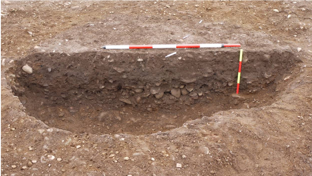
Figure 9: North facing section of [5512]

The most northerly of the three features was a large pit [5512] that was 2.5m by 1.9m in plan, and up to 0.56m deep. The pit had shallow sides, slightly steeper on the eastern side, with the base relatively level but sloping down to the east (see Figure 9). The upper fill of this pit (5513) was extremely charcoal rich, with individual pieces of charcoal at up to 10x7x5cm in size. There was also a significant amount of burnt bone. Though these were spread throughout the fill, there were some concentrations within the fill. The lower fill (5598) of this pit was a 30cm deep dump of small rounded stones, maximum size 17x15x7cm.