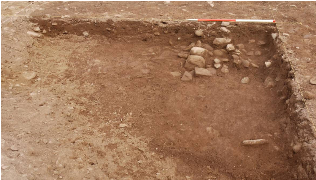
Figure 4: Large pit [5502] during excavation

A micro-morphology sample was taken from the primary fill and the natural clay in order to ascertain how long this sediment took to form, and to identify any pollen that may remain in the soil in order to help date this feature and reconstruct the environment at the time.