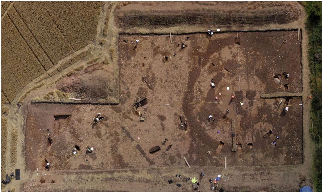
Figure 2: Vertical image of Trench 5. The Trench 5B area is left (east) of the red line. Grid north is towards the bottom.

Trenches 5A and 5B essentially denote areas within a larger trench, 5, situated over a range of cropmarks across the northern side of the palisaded enclosure. Trench 5A focused on the double palisaded enclosure and is discussed in a separate report (James & Gondek 2010). The area covered by trench B was L-shaped, with the eastern half measuring 30m north-south by 10m, and an extension measuring 20m east-west by 15m running from its southwest edge. The distinction between the two areas was based on a roughly arbitrary notional line running north-south, with area 5A to the east.