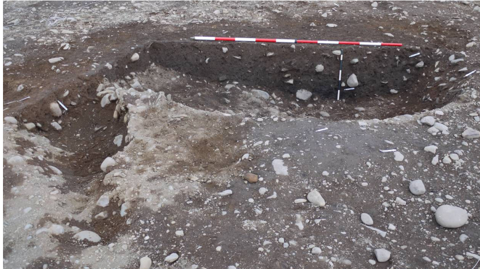
Figure 10: North facing section of [5514]

Pit [5514] cut a tree-throw [5516] towards the northeast end of the pit (see Figure 10). This large feature had a single fill, (5517), which yet again had within it a cup-marked stone (SF 5521) indicating that potentially this tree was felled a short time before the pyre pit was situated here.