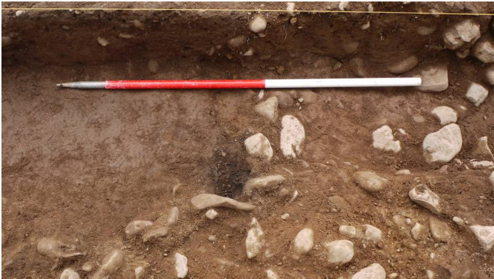
Figure 5: Charcoal lens in posthole [5504]

There was a lens of charcoal and dark silty material (5573) in the southwest area of the posthole (see Figure 5). This lay just outside postpipe (5575), and c.15cm below the surface. (5626) was to the north of postpipe (5575), and consisted of dark brown silt with small stone inclusions. This fill may well be the same as (5627), which was also a dark brown silt fill with small stone inclusions, that lay between (5575) and (5574). Fill (5627) also came down onto rounded stones (5623), probably packing. The penultimate fill found was (5624), a pink-grey clay which underlay (5575). This fill may also be part of the postpipe, but as it was under the level of the water table, this may explain the different soil-type. The lowest fill of posthole [5504] was (5625), medium brown-grey sandy clay. This appears to be similar to the natural clay, but is slightly darker in colour, and contained charcoal inclusions. As this post does not appear to have been burned, this charcoal may represent deliberate deposition in the bottom of the posthole prior to the post being erected, or the charring of the base of the post to increase the life of the post.