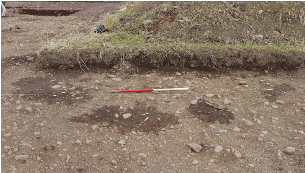
Figure 12: Arc of posts, or semi-circular post setting

Feature [5564] was the southernmost of the possible postholes. This feature was fairly amorphous in plan, with a slight NW-SE alignment. It measured 1m by 0.58m and 0.38m deep. The upper fill was (5565); at only 0.05m thickness, this deep dark brown silty sand was most likely remnants of the topsoil. The other upper fill (5617) was restricted to the northwest end of the feature; this was medium yellow brown silt, only 0.06m deep. The rest of the cut was filled by (5619), a medium orange-brown coarse sand and gravel fill, very similar to the natural, but very compacted. There was no evidence for a postpipe in this cut, so any post may have been removed, allowing the natural soil to wash in, with only a little of possible original fill remaining, with a few stones that may be the remnants of packing. This may also have been a pit.