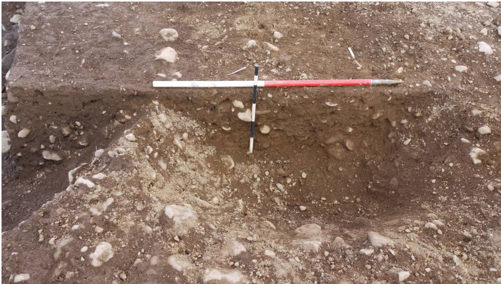
Figure 11: West facing section of [5516] and [5514]

Pit [5514] cut a tree-throw [5516] towards the northeast end of the pit (see Figure 10). This large feature had a single fill, (5517), which yet again had within it a cup-marked stone (SF 5521) indicating that potentially this tree was felled a short time before the pyre pit was situated here.