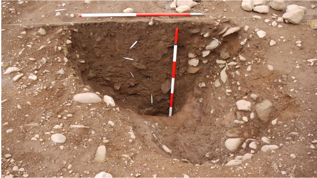
Figure 6: East facing section of posthole [5506]

The avenue posthole immediately the north of [5504] was [5506]. Due to the remnants of a palaeochannel running through the trench here, this posthole was not as clear as those on the western side of the avenue were. (This scenario was also encountered in 2007.) The eastern half of this feature was excavated. In plan this feature was 2.06m x 1.9m, and up to 1.3m deep. The sides of this feature were vertical on the SE and NW, but were stepped to the NE (see Figure 6). This has been interpreted as the ramp of this feature; the steps used by those digging the feature were then used to aid the erection of the post. The section string was moved during excavation of this feature in order to get a safe working space to reach the bottom of the feature.