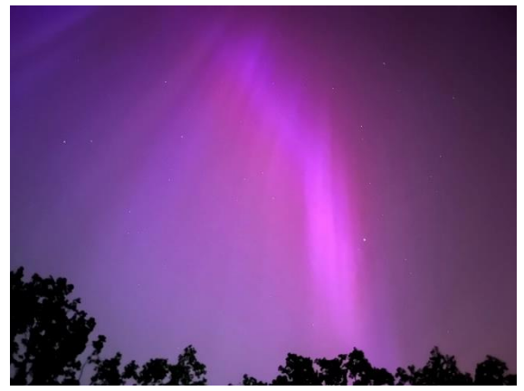
Fig. 3. Aurora in the midnight in May 2024.

Furthermore, I also visited Berlin on the weekend since it is near GFZ (Potsdam). It is a beautiful city with great sightseeing opportunities. Here are some memories from Berlin.