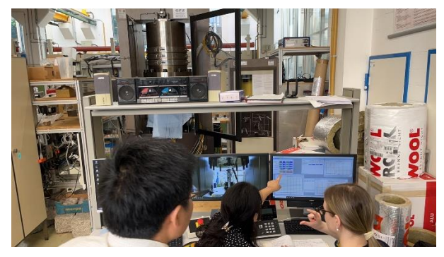
Fig. 2. Some interesting academic team work in GFZ.