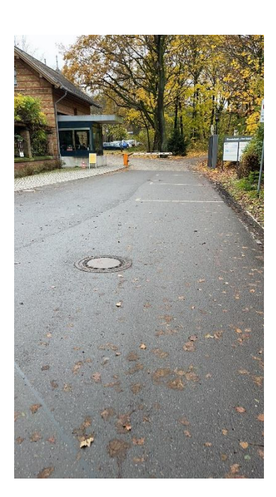
Fig. 1. Some memories in GFZ.