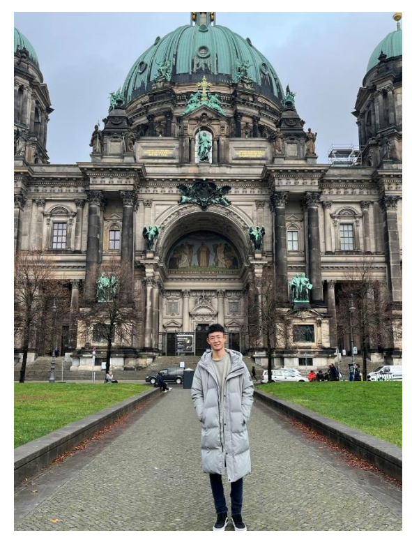
Fig. 4. Brandenburger Tor (left) and Berlin Cathedral (right), respectively.