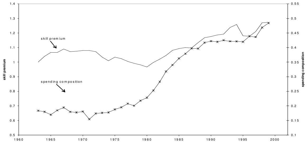
Figure 1. Government spending composition and the skill premium: 1963-99

Source: BEA NIPA tables sec. 5 for government spending composition, and the skill premium is taken from Krusell et al. (2000) and CPS (1999). Government spending composition is government investment in R&S as a share of total public investment.